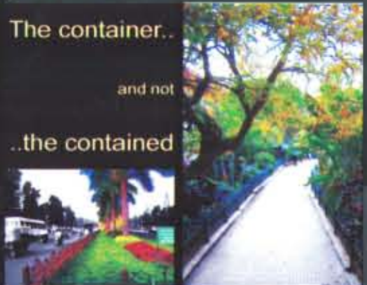
The container... and not... the contained

The canvas of our country's physical realm is being modified drastically at a scale that is unprecedented. The landscape architects' involvement is critical in development works of varying scales and typologies. These comprise of a complex range of projects that include infrastructure projects, regional landscapes, housing, institutional, recreational, urban, heritage, industrial and residential projects. In addition to developing technical capabilities, the landscape architect today, needs to develop a critical sense of the profession and evolve a value system and a keen sense of inquiry, which will allow appropriate responses in such times of flux. The program at Faculty of Architecture, CEPT University is designed carefully to allow this comprehensive and in-depth understanding of the profession.